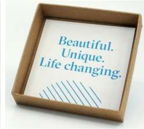
Charm card (8.5x8.5m)