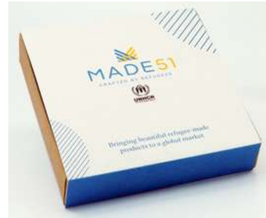
Charm box (10x10cm)