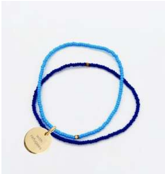
With Refugees Bracelet

Beaded unisex bracelet crafted by South Sudanese refugee women