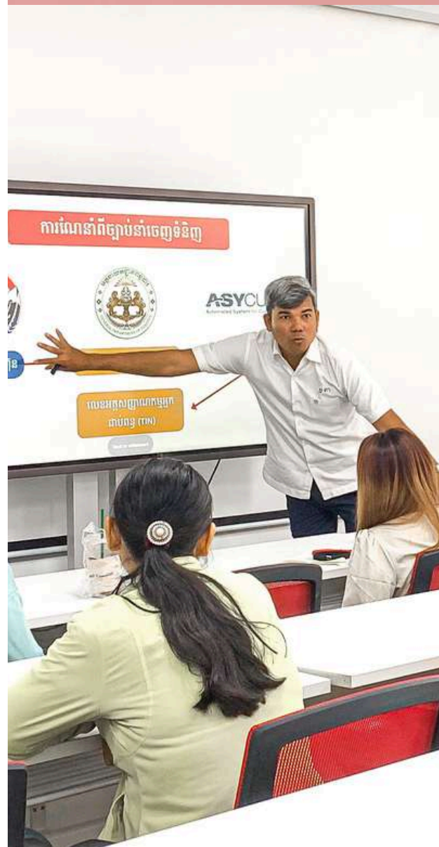
TRAINING DELIVERING SESSION 02 (NOVEMBER 2024)

By following the recommendations from this handbook, waste handlers can improve their operational practices, ensure compliance, and position themselves for growth in the evolving waste management landscape.