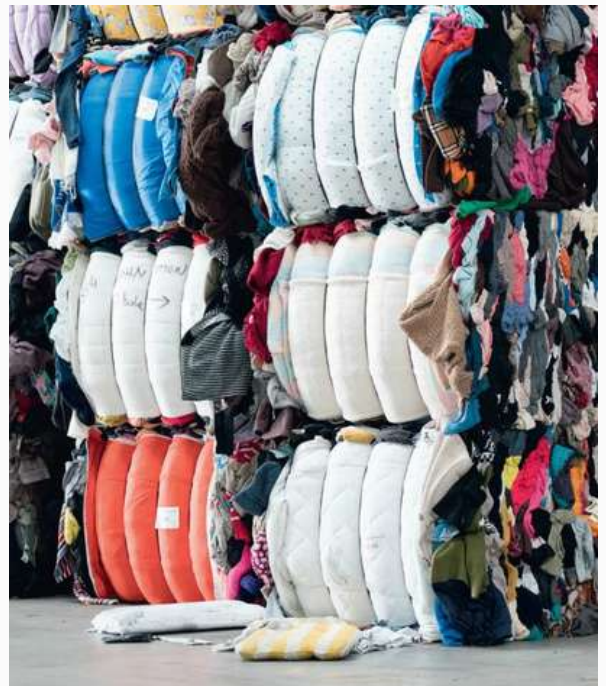
TEXTILE WASTE BALES READY FOR EXPORTS