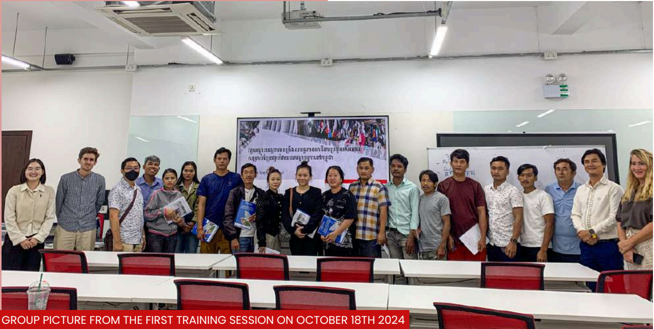
GROUP PICTURE FROM THE FIRST TRAINING SESSION ON OCTOBER 18TH 2024